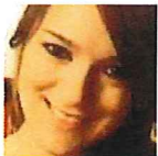
w4m Santa Clarita, CA