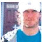
m4w Santa Rosa, CA